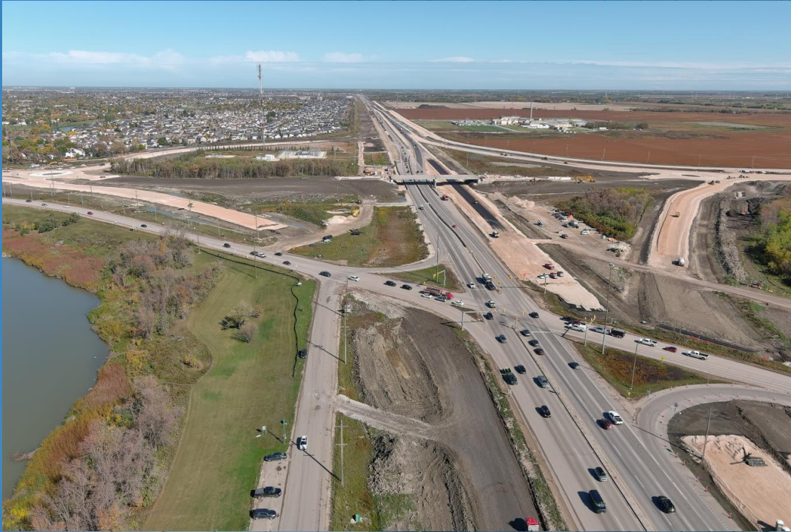
St. Mary's and Perimeter Interchange