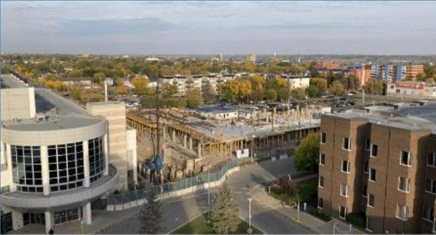
Brandon Regional Health Centre | September 2023