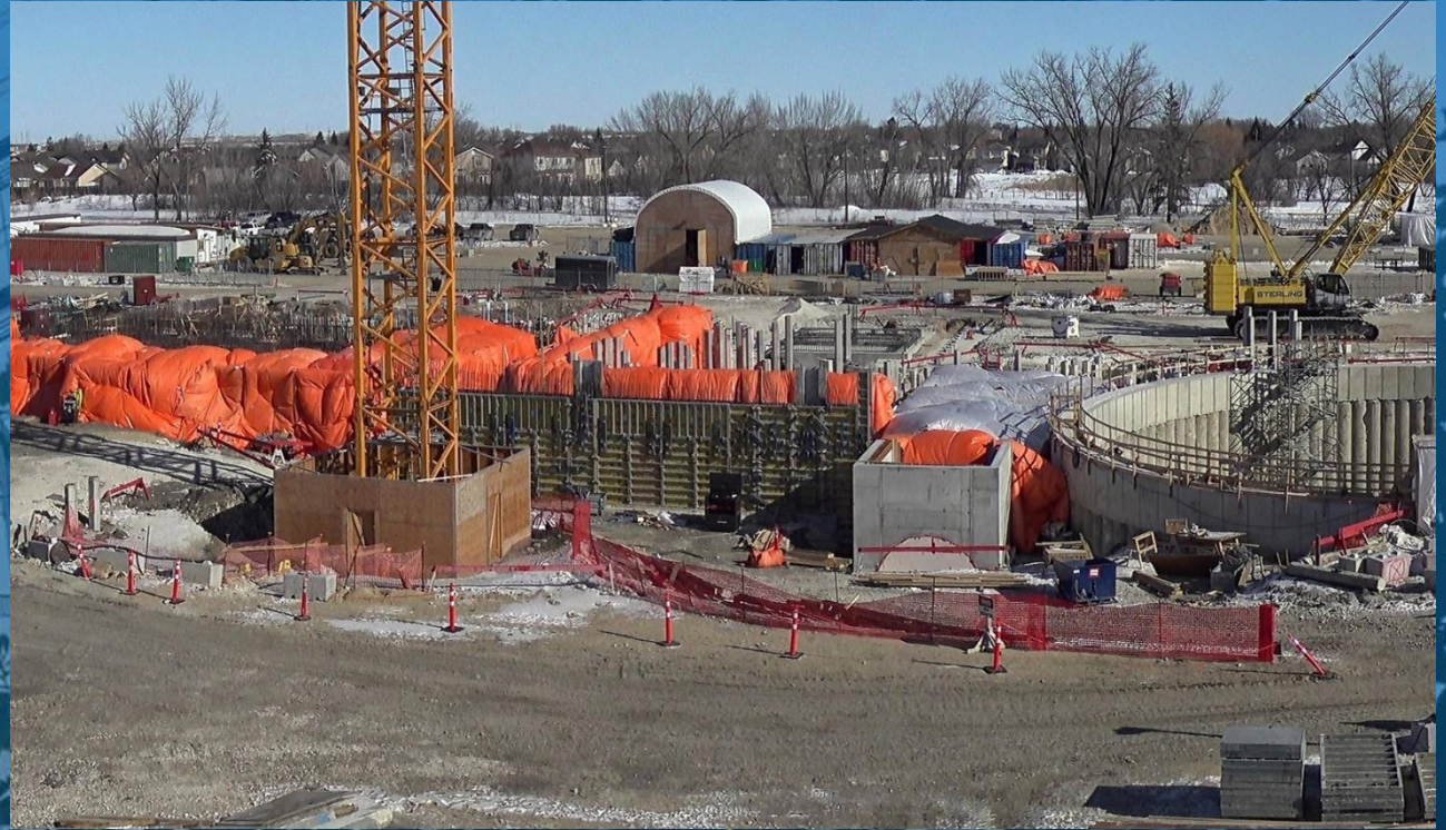
NEWPCC – Part 1.