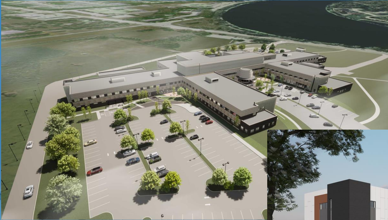
Portage Hospital and Neepawa Hospital