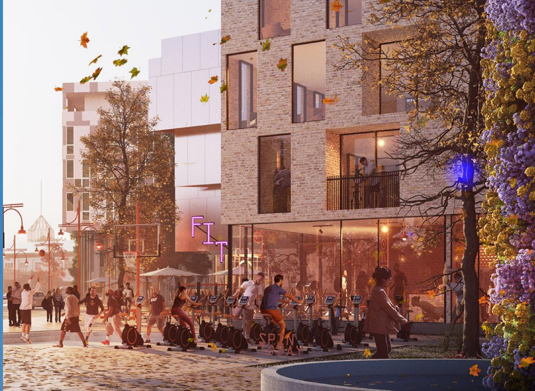
Railside (South) at The Forks