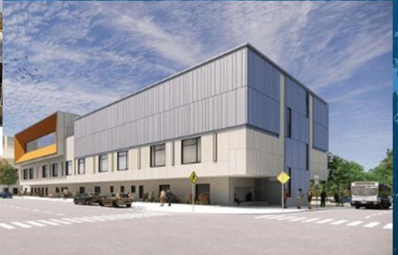
Brandon Regional Health Centre